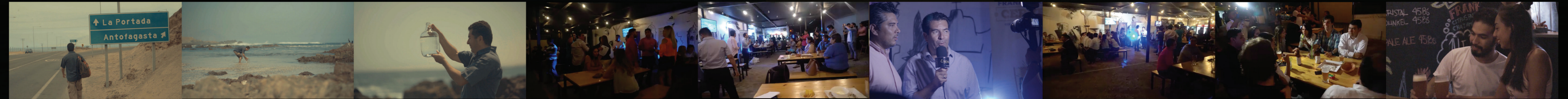
Antofagasta-Chile: Recollecting seawater